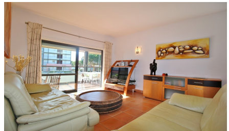
Spacious 2+1 bedroom apartment set in a condominium close to the Marina and Meia Praia beach.

This development was designed for residential purposes, but with a great potential for investment and it encloses landscaped gardens, tennis courts, children's play area and a large communal swimming pool. There is also patrolled surveillance throughout the night and a reception office open during the day. The accommodation comprises a living & dining area, a fully equipped kitchen with integrated appliances, 2 double bedrooms, 1 office converted into the third bedroom, all with fitted wardrobes and 2 bathrooms (1 en-suite with a bath). Both the living area and the master bedroom share a large balcony facing south, with sunlight till the end of the day which is ideal for an "al fresco" dining with views over the garden! Further features include: video entry system, inverted cooling and heating conditioning system installed, double glazing, an allocated parking space plus a storage room in the safe underground garage.