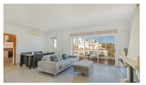
Great 2 bedroom golf village townhouse with a communal pool and beautiful gardens, close to Burgau and Praia da Luz.

This townhouse is set in a golf village of Parque da Floresta, next to Budens with all amenities within walking distance and only 5 minutes drive from the nearest beaches of Burgau and Praia da Luz. Spread over 2 levels, the accommodation comprises a large living and dining area with a wood burner fireplace, a fully fitted kitchen with integrated appliances, 2 double bedrooms with fitted wardrobes ensuite bathrooms and a guest's toilet. There is a roof terrace that boasts lovely views over the golf course and surrounding countryside. Further features include: double glazing, inverted cooling and heating conditioning system installed. This property is perfect for a holiday home in a and an ideal investment for golf holiday rentals.