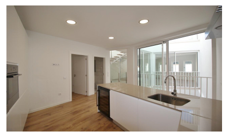
Fantastic 2+1 bedroom townhouse with garage in the historical centre of Lagos, within walking distance to all amenities and the beach.

Set in the historical centre of Lagos, this brand new 2+1 bedroom townhouse, with garage, was built in a contemporary design with straight lines and white walls and ceilings, using quality fittings, wooden stair steps and wooden floors. The accommodation is spread over 3 levels. The ground floor offers an entrance hall leading to 1 bedrooms, an office that can be converted into a second bedroom, a bathroom and an indoor patio. There is also a direct access to the garage. On the middle floor, there is a large open living & dining area, a fully fitted kitchen with a breakfast bar, a laundry / storage and a guest toilet. Large windows and skylight give a very good natural light flow all over the rooms. The upper level hosts the master bedroom, a spacious shower room, a covered terrace and nice outdoor space with views over the old town. Further features include double glazing, solar panels for water heating, air conditioning, thermal and acoustic insulation. This modern and top quality townhouse is a fantastic residence or holiday home in the heart of Lagos centre. Viewings are essential to fully appreciate all the features.