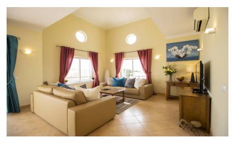
Lovely 3 bedroom townhouse with a private garden and sea view, set in a Resort just 5 minutes walk to the beach of Salema.

Beautiful 3 bedroom townhouse set in a Resort with reception service, communal swimming pool and lovely gardens. The resort is located in Salema, within a short walking distance to all amenities and the beach. The property is spread over two floors offering fantastically spacious areas and terraces with sun exposure inviting for a relaxed outdoor living, with a lovely sea view! The upstairs accommodation, offers a large open living and dining area with a wood log fireplace and a balcony with space for a dining table and barbecue, boasting sea views, a fitted kitchen with dining space and large sliding windows that flow onto another balcony, also with sea views and outdoor stairs leading to the roof terrace with sun loungers and fantastic panoramic views over the country and sea side. There is a guest's toilet on this floor. The downstairs comprises three double bedrooms with fitted wardrobes, the master with a private en-suite bathroom and large sliding windows opening to the garden and private covered terrace on the ground floor. Further features include: double glazing, underfloor heating on all rooms. Set just a short walk from Salema village and the beach, these properties are perfect for a holiday home, as well as a good rental property in a renowned Resort.