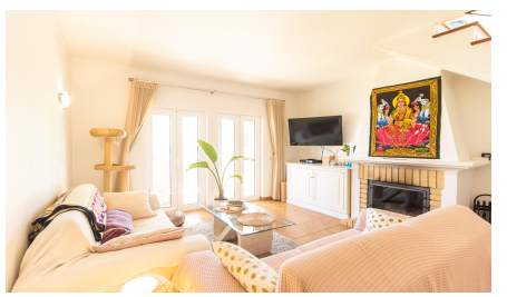
Fabulous 2-bedroom south-facing townhouse in a prime position with stunning views across the golf course and out to the ocean.

This delightful 2-bedroom townhouse has superb sea views from both the lounge and the large private roof terrace. The spacious lounge and dining area opens out on to a secluded terrace with a beautiful view of gardens, golf course and ocean. Within the lounge is a log-burning fire providing all winter warmth requirements. The fully furnished kitchen has views of the courtyard to the front of the property. There are two double bedrooms, each with fitted wardrobes, and lovely views of the gardens. The master bedroom has an en-suite shower room and separate dressing area. A family bathroom and entrance hall complete the ground floor. Upstairs leads to a tranquil roof terrace with breath-taking views of the golf village, gardens, golf course and a panoramic vista of the Atlantic Ocean. The property benefits from discounts on the golf course and clubhouse, plus the use of the communal swimming pool and spa. Off street parking is close to the property.