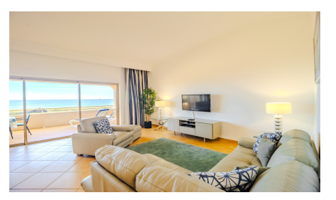
Fantastic 2 bedroom apartment with stunning sea views set in an exclusive resort with communal swimming pool, overlooking the beach of Meia Praia.

Set in a quiet, secure, private complex hosting services including a full service reception, lovely communal pool with beautiful water features, all surrounded by and beautifully manicured gardens. As you enter the apartment, you walk into a large open plan living and dining area that leads to a spacious south facing balcony with plenty of space for lounging and dining and a wonderful view over the beach. There is a fully fitted modern kitchen with integrated appliances next to the living area. On the left side of the apartment there are two spacious double bedrooms with built in wardrobes and 2 bathrooms, one is en-suite. The master bedroom also has a walk-in wardrobe. Both bedrooms have access to a south facing balcony. The family bathroom is also wonderfully spacious and the apartment benefits from a large storage room. There is also an allocated space in the underground car park. Due to the fantastic beachfront location and high level of facilities offered by the complex, this apartment is an ideal investment as a home from home and rental property.