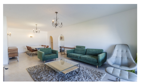
Fabulous 2 bedroom apartment in Lagos, located on the forth floor with stunning sea views

Positioned on the fourth floor, this two bedroom apartment in Lagos enjoys superb sea views extending across Meia Praia. The property boasts a spacious living and dining room, with a large terrace from where you can make the most of the views while dining or relaxing outdoors. The fully equipped kitchen is conveniently situated adjacent to the dining area, and also connects to the terrace. With two comfortable bedrooms, and a family bathroom the apartment offers comfortable living space. Nestled in a calm residential area of Lagos, the apartment is close to the supermarket and only a fifteen minute walk to the historic centre of Lagos.