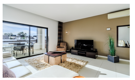
Superb 2-bedroom apartment with views of the sea and the cliffs of Porto de Mós.

Ideally located on the stunning Porto de Mós beach in Lagos, Algarve, this apartment offers breathtaking views of the beach and cliffs. Situated within a tourist resort, you will enjoy luxurious amenities such as outdoor and indoor pools, a modern gym, and a spa, all just a 3-minute walk from the beach. Upon entering the apartment, the hallway leads to a bright space composed of the living room and a modern, fully equipped open-plan kitchen. The living room opens onto a long balcony with views of the resort's main pool and the sea. Returning to the entrance, the hallway leads to two beautiful bedrooms, one of which is en-suite. Both bedrooms, fitted with built-in wardrobes, also provide access to the terrace. The two bathrooms are equipped with bathtubs. The apartment features reversible air conditioning, underfloor heating, and solar panels, ensuring year-round comfort while respecting the environment. This property represents an exceptional opportunity, whether for year-round living, holiday getaways, or as a rental investment in one of the most sought-after regions of the Algarve. Its idyllic location and high-quality amenities make it a true coastal paradise, combining modern comfort with natural beauty.