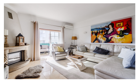
Spacious 2 bedroom apartment close to the center of Lagos.

This spacious 2 bedroom apartment is situated on the first floor of a peaceful building in Lagos, offering both comfort and practicality. As you step inside, a welcoming hallway connects all areas, leading to a bright and spacious living and dining area. This inviting space features a fireplace and opens onto a south and eastfacing balcony, perfect for enjoying the Algarve sunshine. The fully furnished and equipped kitchen includes a pantry for extra storage and direct access to a balcony shared with the living room, creating a seamless flow between indoor and outdoor spaces. The apartment boasts two generously sized bedrooms, both with built-in wardrobes. The master bedroom has a private en-suite bathroom and its own balcony, while the second bedroom shares an east-facing balcony with the living room, ensuring plenty of natural light. A second fully equipped bathroom adds to the convenience. The apartment is equipped with invert A/C units as well as ceiling fans. Impeccably maintained and in excellent condition, the apartment offers nearby public parking and is ideal for those seeking a permanent residence or a rental investment. With its blend of modern comfort and traditional charm, this property is a fantastic opportunity in the heart of Lagos.