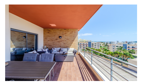
Stylish 2 bedroom apartment with sea views, just a short walk to the Marina, Meia Praia beach and the old town of Lagos.

This beautifully presented apartment offers panoramic views across the city of Lagos and out to sea. Ideally located, the property is just 800 meters from both Meia Praia beach, the marina, and the charming historic centre of Lagos. Situated within a wellmaintained private condominium with a swimming pool, the apartment welcomes you with an elegant entrance hall that leads into a bright and spacious living area. Large sliding doors open onto a generous balcony, ideal for lounging in the sun, or dining al fresco while enjoying the views. The modern, fully equipped kitchen offers plenty of space for cooking and entertaining. The master bedroom features a private en-suite bathroom and both bedrooms benefit from large fitted wardrobes and direct access to a second balcony, which also enjoys open views. The guest bedroom is served by a stylish family bathroom. Additional features include electric shutters, air conditioning, double glazing, a designated parking space in the communal garage, and a private storage room. Residents also have access to a lovely communal roof terrace. This apartment is an excellent choice whether you're seeking a full-time residence, a holiday getaway, or a smart investment with great potential for both short and long-term rentals.