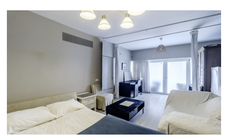
Lovely 2 Bedroom Apartment with Stunning Marina Views - Lagos Marina

Set in a prime location in the heart of Lagos Marina, this beautifully designed top-floor apartment offers sweeping panoramic views over the marina, bay, and town. With a privileged east-facing orientation, the apartment is bathed in morning sunlight and features a large private terrace—perfect for relaxed al fresco living and enjoying the vibrant marina atmosphere. Inside, the open-plan living and dining area is spacious and bright, with direct access to the terrace—ideal for watching the sunset over the boats and surrounding landscape. There are two generous bedrooms, both west-facing to catch the afternoon sun. The master bedroom features an en-suite bathroom, while a spacious family bathroom and fully equipped kitchen complete the layout—designed for both comfort and practicality. The apartment also benefits from air conditioning throughout. Whether you're looking for a full-time residence, a holiday escape, or a smart investment, this is a rare opportunity in an unbeatable marina location.